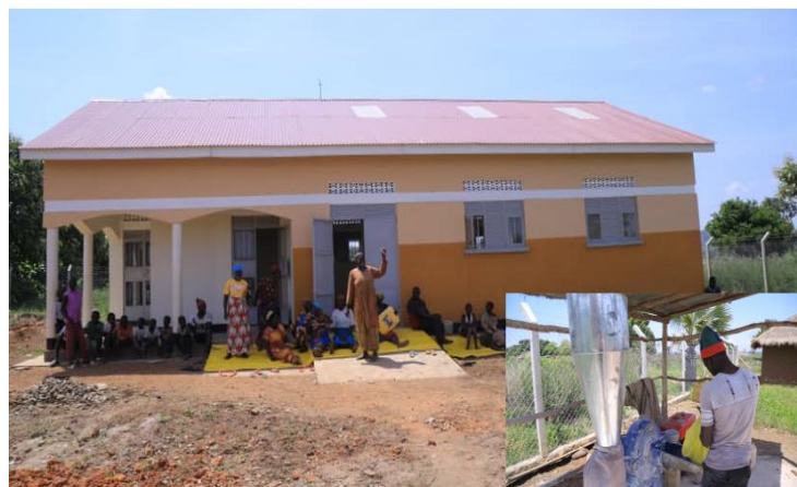
Matching Grants beneficiaries Binagoro Women's group, Yumbe district at their facility offer milling services to the community