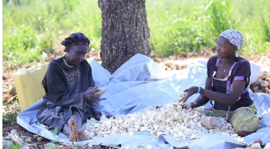
Group members crash cassava into smaller pieces ready for drying