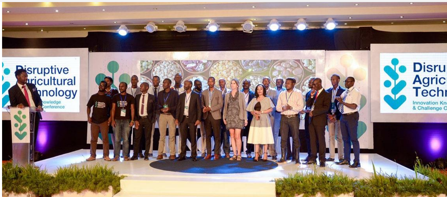
Selected Agri-Tech firms at the Disruptive Agriculture Technologies challenge- Munyonyo Resort Hotel- Kampala