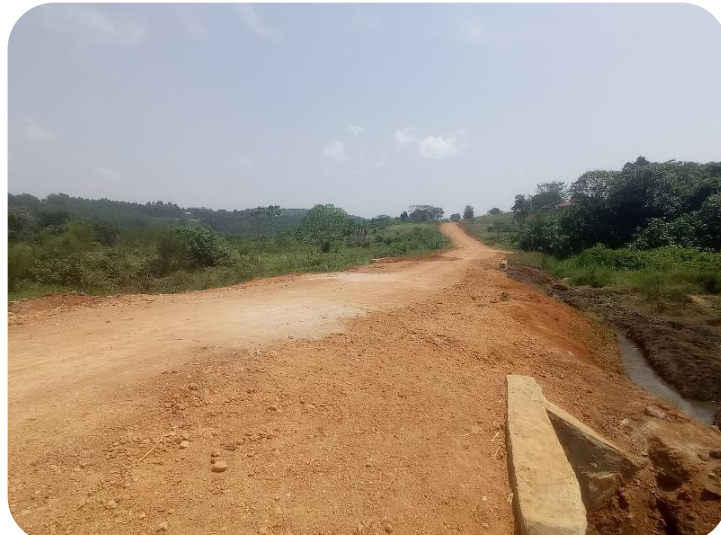
After: The road was raised, filled with marram and culverts installed

One of the major Investments, the ACDP project has done at the community level is the removal of bottlenecks commonly referred to as “road chokes” on critical farm access roads. This investment primarily targets the removal of bottlenecks that impede transportation to and from areas of production. This is a key strategic output of the project that aims at improving accessibility of production areas to post-harvest handling centres and markets.