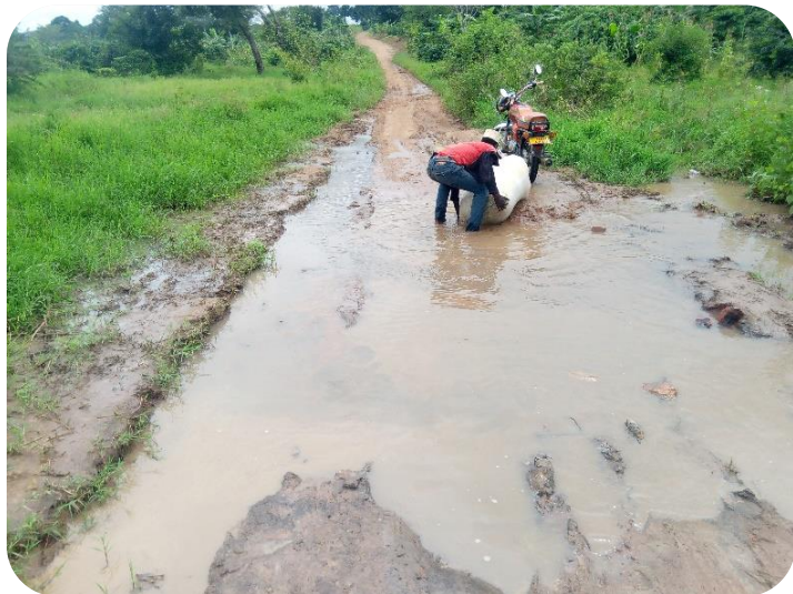
Before: Flooded section of Buwanda swamp, Kalungu district