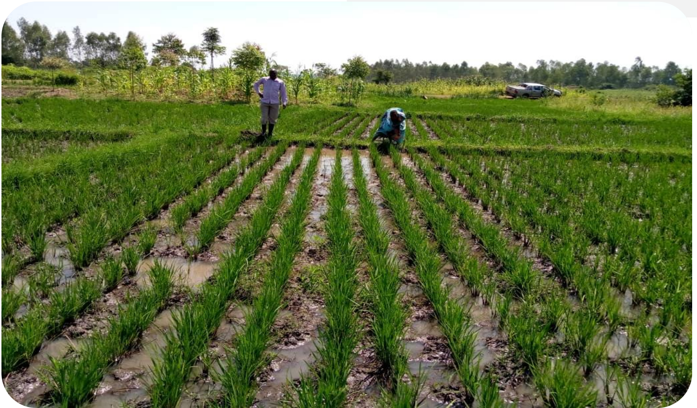
ACDP rice farmer, Iganga cluster

Some of the reasons that can be attributed to the high enrollment levels in these clusters are the highly organized farmer groups and the crops grown in these clusters. For example in Kalungu cluster alone, 55 farmer organizations were awarded Matching grants, In Soroti cluster, 36 farmer organizations submitted business plans and in Ntungamo cluster 28 farmer organizations have been funded for construction of storage facilities and purchase of machinery. The crops grown in these clusters are beans, coffee, cassava, rice and maize.