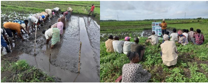
Independent Musomesa Field School (Nursery bed making training) in Ibulanku Sub County, Bugweri District

In Bugweri District, surprisingly, the Agricultural Officer (AO) and a Musomesa who graduated MFS in 2019 have started their own MFS based on the experiences with PRiDe II. All the AOs receive training posters after the Training of Trainers (TOT) at NaCRRI, therefore, they can utilize such materials for training in villages.