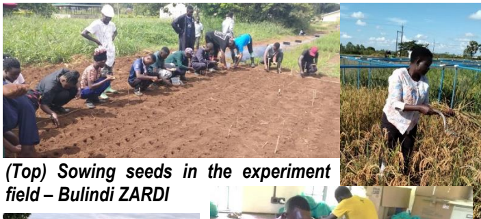
(Top) Sowing seeds in the experiment field – Bulindi ZARDI

Each target research institute understands several important roles for strengthening the linkage between research and extension, and the importance of capacity development for sustainable research works.