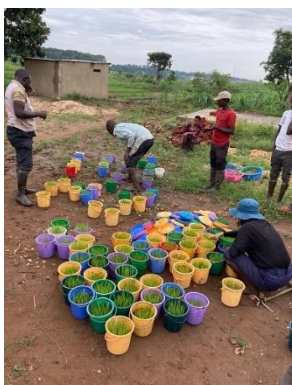
(Bottom) Preparing seedlings for Preliminary National Performance Trial – Ikulwe Station, Buginyanya ZARDI