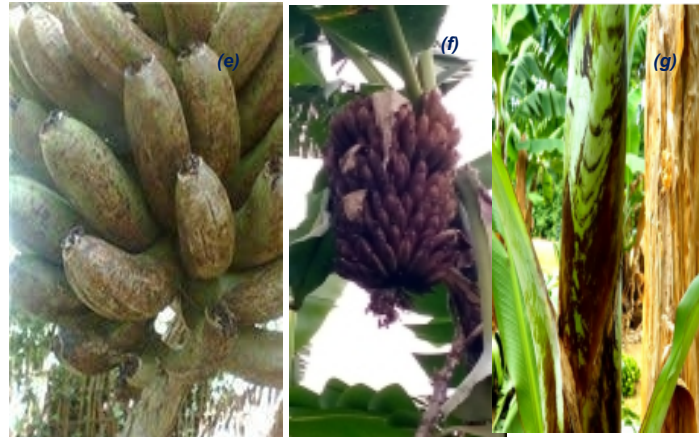
Fig 2. Severe infestation of Banana fruit by Red Rust Thrips (Rusted appearance on Fruits e-f, V-shaped marks on stem-g)

Red Rust Thrips of Banana prefer to feed on very young, tender, succulent, immature fruits, flowers, and foliage; they sucking out cellular components from surface cells. In leaf sheaths, feeding causes characteristic dark, V-shaped marks on the outer surface of leaf petioles. Damaged tissue becomes bronzed or rust-colored with age. Feeding damage to the fruit occurs on fingers soon after the flower petals dry, on mature fruit, oval-shaped, reddish "stains" may be seen where the fingers touch. Extensive damage may cover more of the fruit surface with reddish-brown or black discoloration and superficial cracks. The cracks expose the inner fruit tissue to opportunistic pathogens that may cause fruit rotting. Though unmarketable, such fruits are still edible.